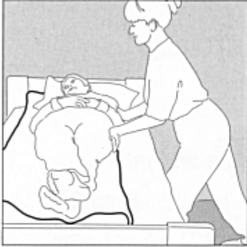
5. Moving a patient toward the wall in preparation for turning outward

SST Slide Large is convenient for turning a patient in bed. It reduces the friction, even under the legs (fig. 5). SST Slide is at its best when the patient is positioned sideways prior to turning, and when correcting his/her posture after the transfer (fig. 6).