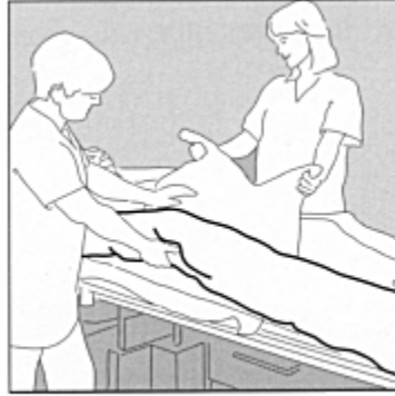
2. Easy to remove