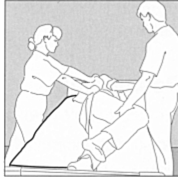
6. Handling a heavy and passive patient who may be sensitive to pain