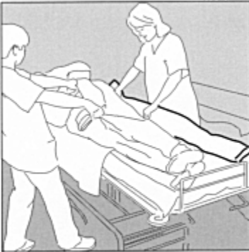
1. Easy to position

Turn the patient onto one side and insert the sliding mat underneath him/her (fig. 1) so that he/she is lying half upon the SST Slide Large. Before starting the transfer, tilt the patient's body slightly so that his/her full weight is on the mat. It is helpful if you can place the SST Slide Large under a sheet or a draw-sheet, enabling a firmer grip and gentler handling (fig. 2).